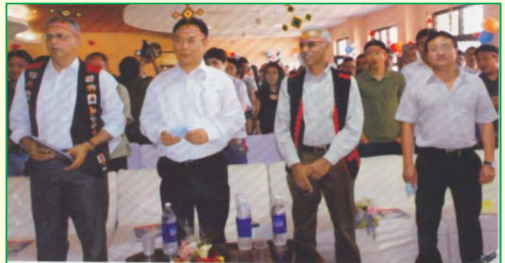
Home secretary GK Pillai (extreme left) with other dignitaries at the fest

Keeping in mind the welfare of people, the apex agency for development in northeast, DONER, has been allocated an additional Rs 285 crores, raising its funds to Rs 1760 from Rs 1475 crore. To promote better air connectivity and facilities, Rs 121 crore has been set aside for the development of airports. In